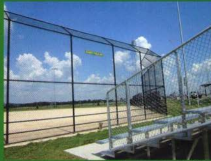
Baseball And Tennis