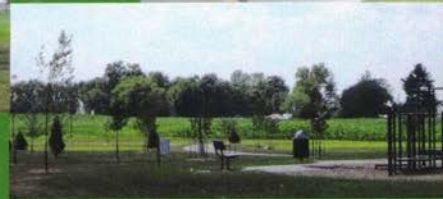
Prairie Creek Park