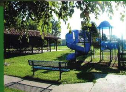
Six Hole Disc Golf Course