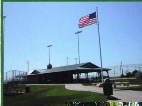
Playgrounds And Volleyball