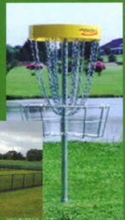
Off-Leash Dog Park