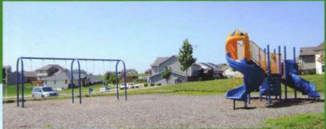
Hawks Ridge Park